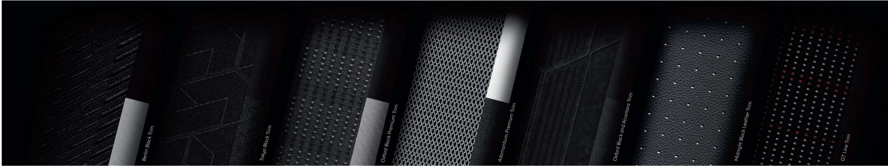
Berlin Black Trim

*Trims vary according to version chosen. Talk to your local Peugeot Dealer about trim options available.