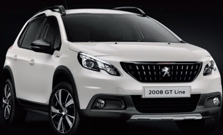
GT Line model in Bianca White with 17" Eridan Brilliant Black alloys.