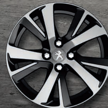
17" 'Eridan' Brilliant Black Alloy Wheel