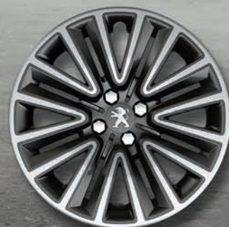
16" Slice Wheel Trim