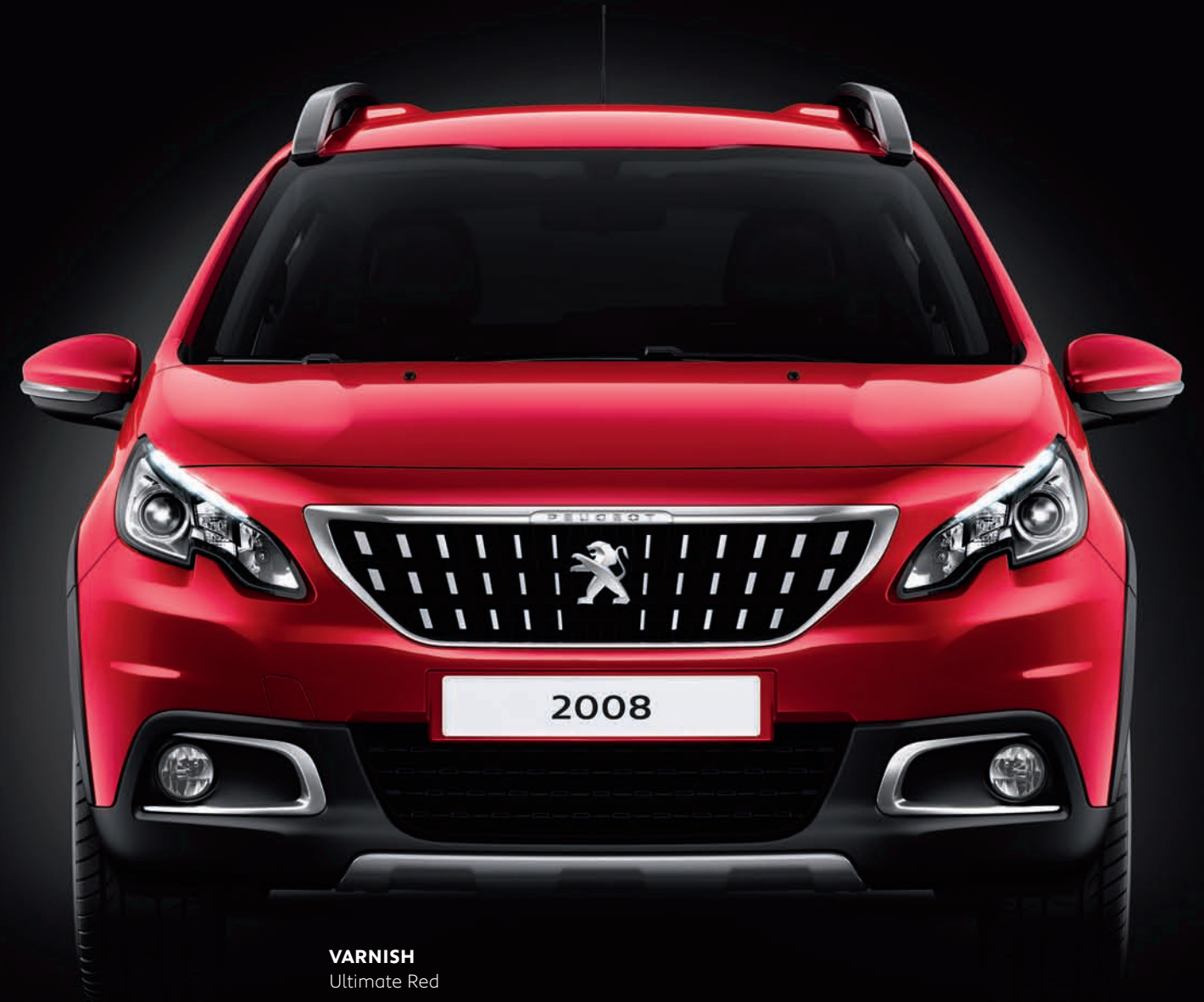
VARNISH Ultimate Red

*Talk to your local Peugeot Dealer about paint options available.