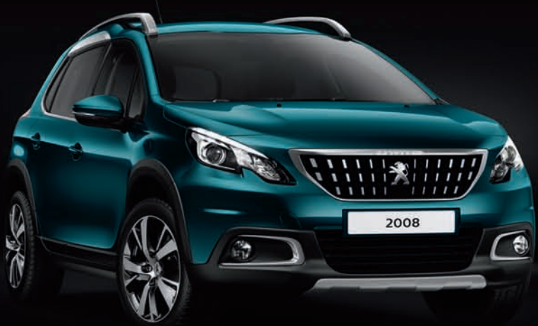
Allure model in Emerald Crystal with 17" Eridan Anthra alloys.