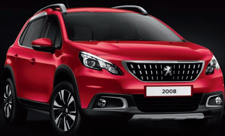
Allure model in Ultimate Red with 16" Aquilla alloys.

*Talk to your local Peugeot Dealer about colour and wheel options available.