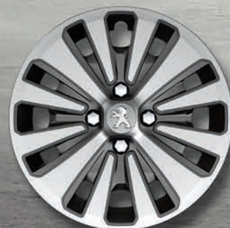
16" Stronium Wheel Trim