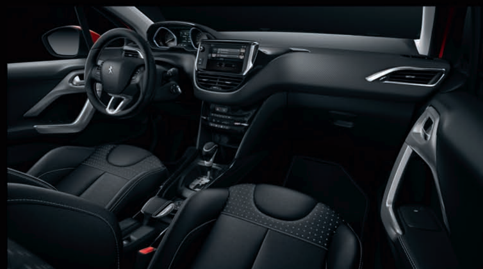
Midnight Black leather trim