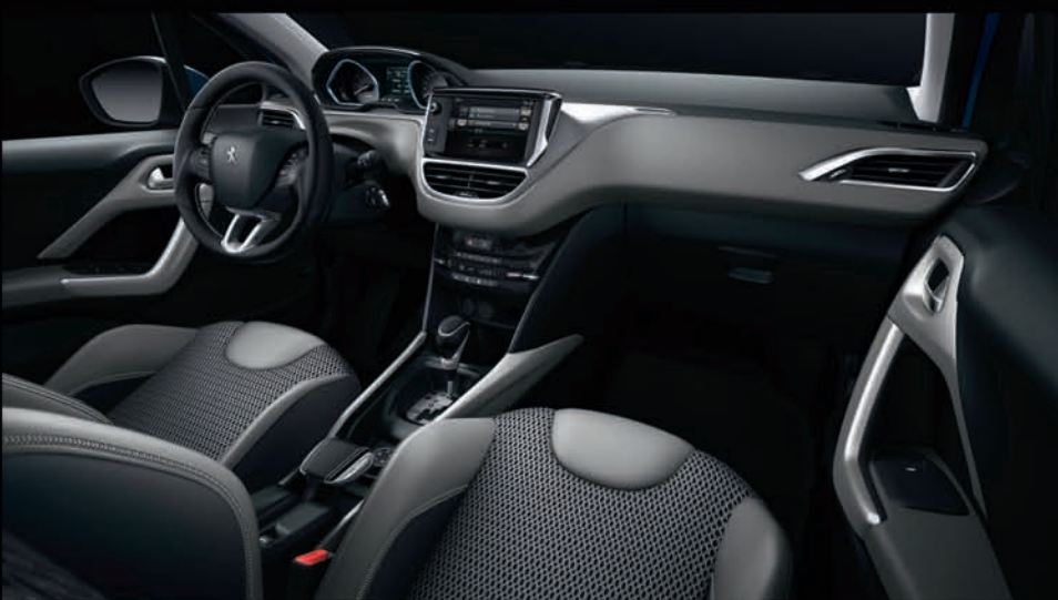
Adamantium Premium trim