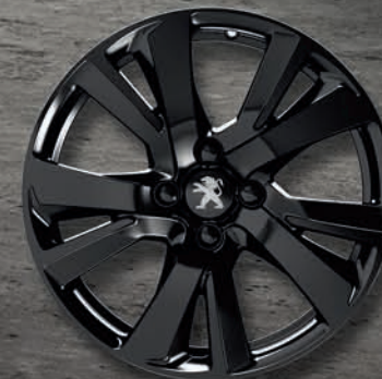
17" 'Eridan' Black Alloy Wheel

* Wheels available according to version. Talk to your local Peugeot Dealer about wheel options available.