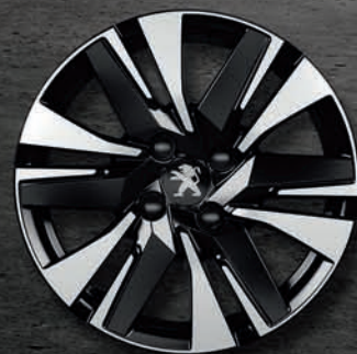
16" 'Aquila' Alloy Wheel