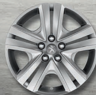
16" Zirconium Wheel Trim