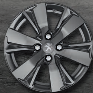
16" 'Hydre' Alloy Wheel