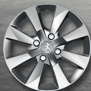
15" Iode Wheel Trim