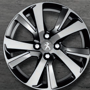
17" 'Eridan' Anthra Alloy Wheel