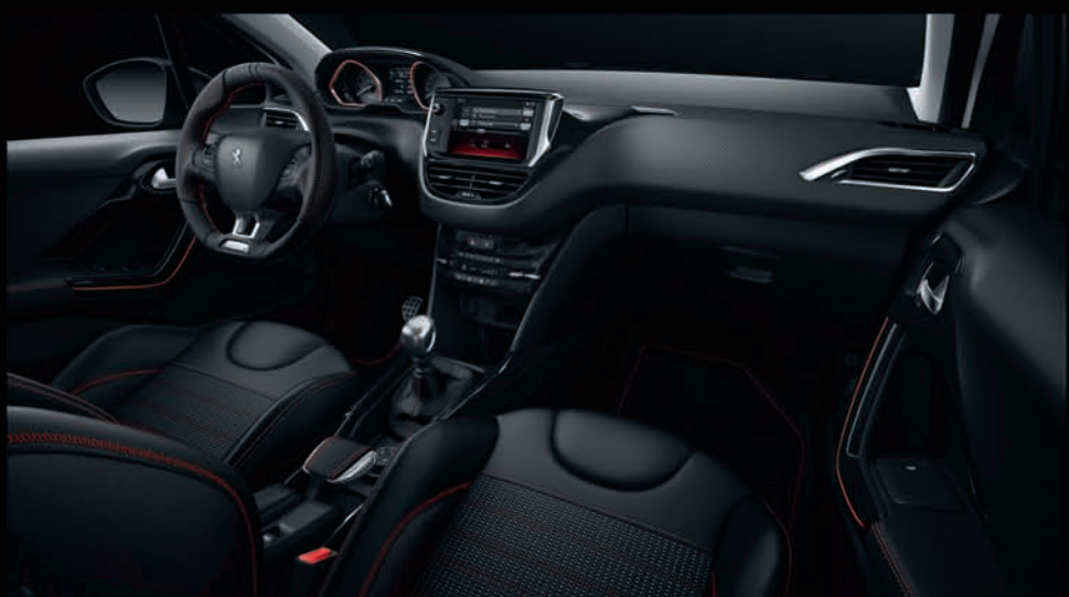
GT Line trim